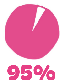
noticed that DT helps students discuss and reflect on their own emotions

"DrawTogether allows students to take risks and use their mistakes to their advantage. Kids absolutely LOVE it." - 3RD GRADE TEACHER, WASHINGTON D.C.