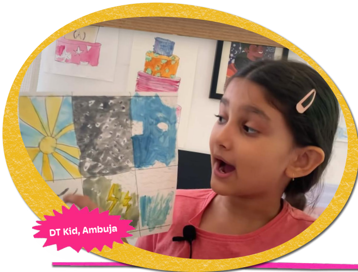
DT Kid, Ambuja