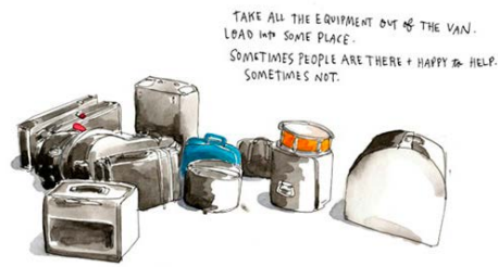
TAKE ALL THE EQUIPMENT OUT OF THE VAN. LOAD UP SOME PLACE. SOMETIMES PEOPLE ARE THERE + HAPPY TO HELP. SOMETIMES NOT.