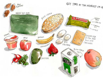
GET FOOD AT THE NEAREST CO-OP.